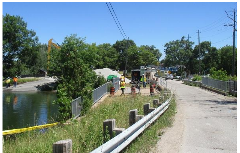
Construction beginning at Bayview Dam E