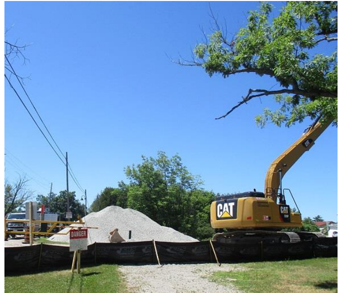
Construction equipment and supplies at Bayview Dam E

The contractor is currently installing the cofferdam – the structure that will provide a dry work space for in-water work – immediately upstream of the dam. Once this is complete, the contractor will begin demolition efforts on Bayview Dam E first, and then Bayview Fixed Bridge and Blind Dam C in early September. After Labour Day, the public can expect a closure of Port Severn Road just before the Bayview Dam E Fixed Bridge in order to allow for its replacement. This closure will remain in place until late December 2018 when this phase of the project is expected to complete. More precise closure dates will be provided as we draw nearer to the date.