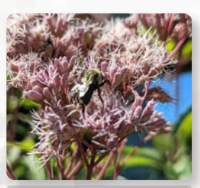
Bee pollinating Spotted Joe Pye Weed