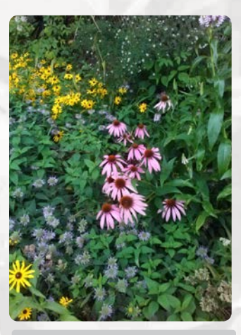
Native wildflower garden with Black-eyed Susan, Purple Coneflower, and Wild Bergamot

Some of the benefits of including native plants around your property: