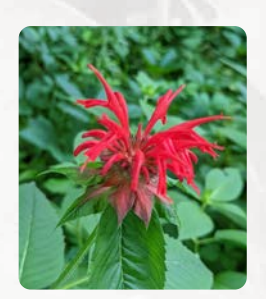
Scarlet Bee Balm blooms July to August and produces a red flower

Refers to approximate flower blooming time and subsequent fruit and seed production, if applicable. This section also indicates the colour of flowers and fruits. A plant's life cycle can vary from year-to-year depending on climate factors such as precipitation and temperature, soil conditions, and nutrient availability. Bloom timing may also differ depending on location across the watershed area, and microclimates on a given property (e.g., sunny versus shaded area).