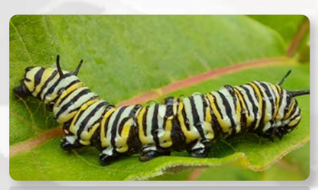
Monarch caterpillar feeding on Common Milkweed

Indicates which groups of pollinators and other wildlife use the plant, and which species are required to pollinate it. Examples include bees, birds, butterflies, caterpillars, other insects and mammals. Some plants in the list support the larvae (caterpillars) or adult stages of specific species of butterflies and moths.