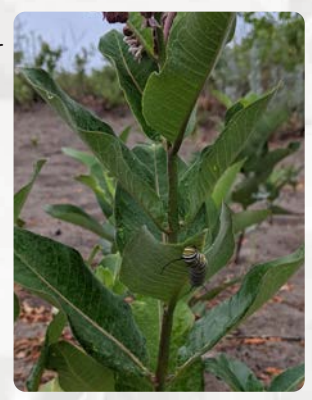
Monarch caterpillar feeding on Common Milkweed

Native plant species generally require minimal water and fertilizer inputs as they are hardy and well-adapted to local conditions. For example, wildflowers like Purple Coneflower ( Echinacea purpurea ) or Common Milkweed ( Asclepias syriaca ) can tolerate a variety of soil types, moisture levels, and sunlight conditions. Maintenance of pollinator gardens generally involves simply managing the spread of new growth beyond desired boundaries, particularly in small areas.